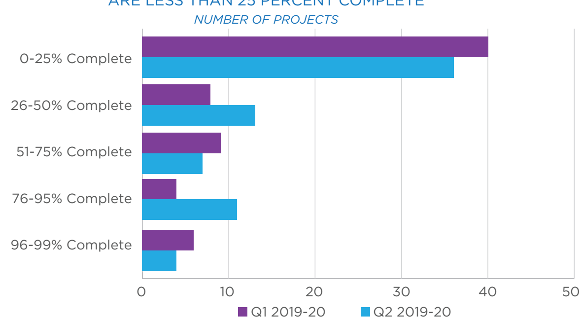
FIG. 2 - THE MAJORITY OF ACTIVE PRIMARY RENOVATIONS PROJECTS ARE LESS THAN 25 PERCENT COMPLETE

number of Primary Renovations projects that are between 76 percent and 95 percent complete, which increased from 4 projects to 11 projects during Q2 2019-20.